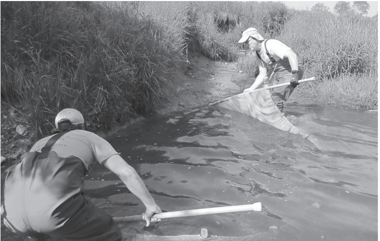
Seining the Rouge